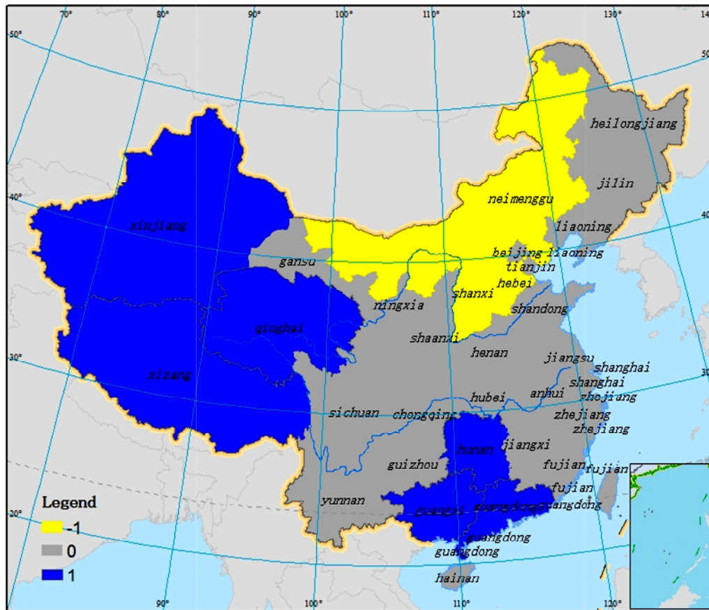
Fig. 2. Provinces with significant changes in CDEP

Beijing and Sichuan, the other 12 provinces all exhibited an increasing trend, which is different from the trends of MAP. Moreover, there are very few changes in the trends over different thresholds.