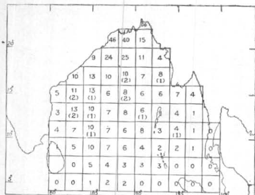
Fig. 1. Space distribution of the occurrence of storms and depressions in the Bay of Bengal and that of the recurving storms during the years 1945-54

(Figures within brackets indicate the number of recurving storms)